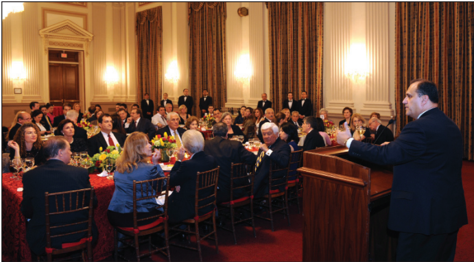
View of the dinner at the Cannon Caucus Room.