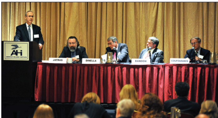
View of the Panel Presentation.

AHI hosted the policy forum "The Evolution of Turkey's Policy in the Eastern Mediterranean: Implications for U.S. Interests" featuring Keynote Speaker Daniel Pipes, president, Middle East Forum and Taube Fellow at the Hoover Institution of Stanford University; and a panel of experts who examined the topic on February 6, 2012 at the Capital Hilton, Washington, DC.